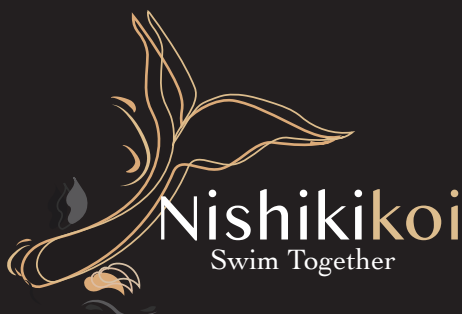
Extended with tagline